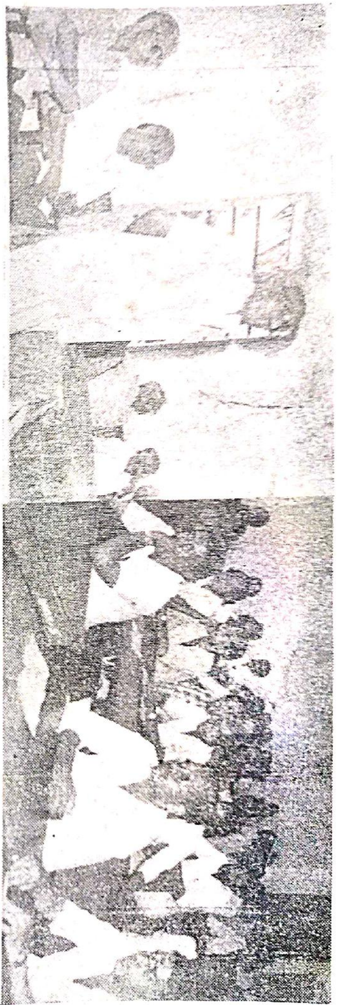
ഈ പന്ത്രണ്ട് പേർ, കോട്ടയം ട്രിപ്പിൾ ടൗൺ കോൺഗ്രസ്സിന്റെ അദ്ധ്യക്ഷൻമാർ. ഇവർ സമാധാനപരമായി സർവ്വതോമുഖമായി